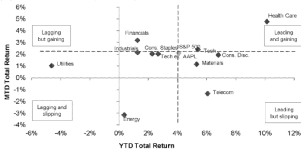
Figure 41: S&P 500 sector ytd vs. mtd performance