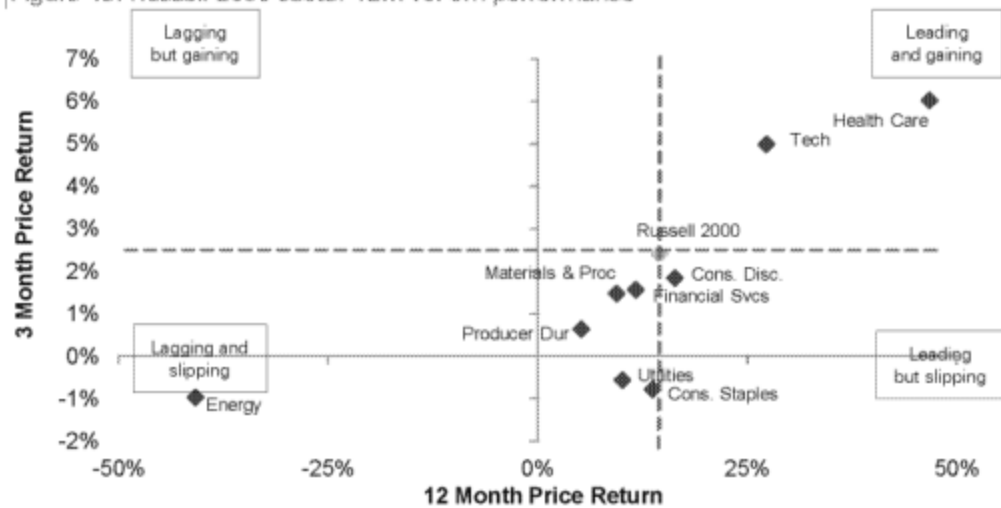
Figure 43: Russell 2000 sector 12m vs. 3m performance