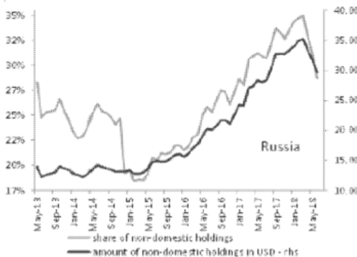
Figure 7: Foreign holdings are back to the lowest level since Q2-17