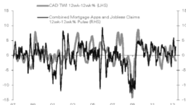
Figure 1: Signals from US housing and labour market support CAD...