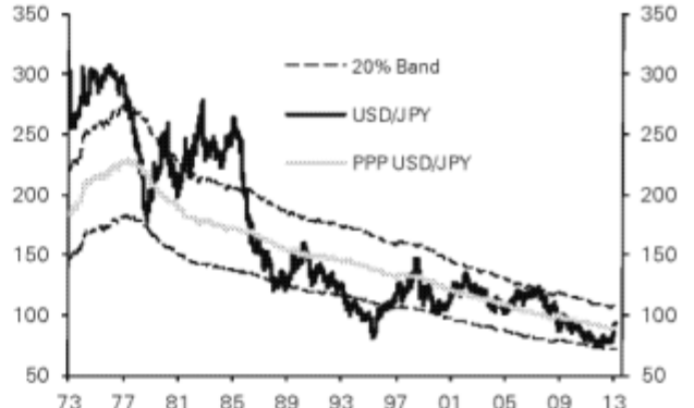
Figure 4: USD/JPY: ...The yen is expensive