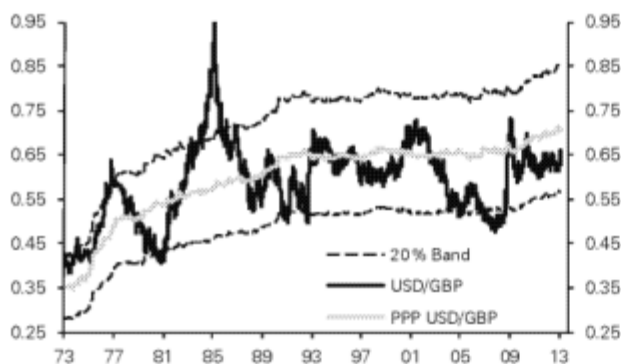
Figure 5: USD/GBP: as well as sterling ...