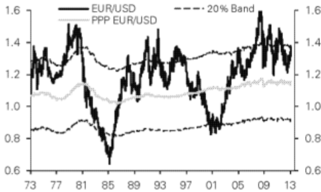
Figure 3: EUR/USD: The euro is expensive though remains within the 20% threshold ...