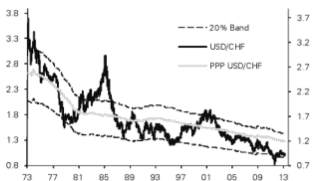
Figure 6: USD/CHF: CHF is expensive