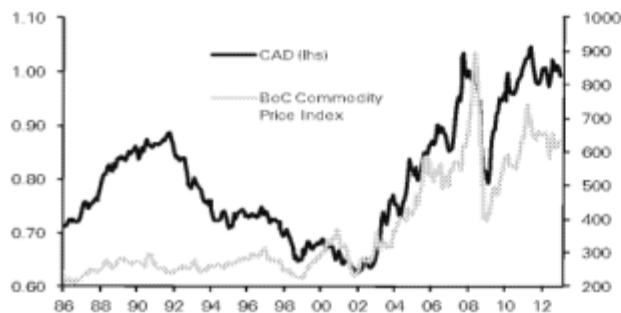
Figure 15: BoC Commodity Price Index (Nominal) and CAD/USD