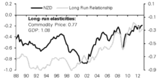
Figure 14: Long-run Relationship-NZD/USD