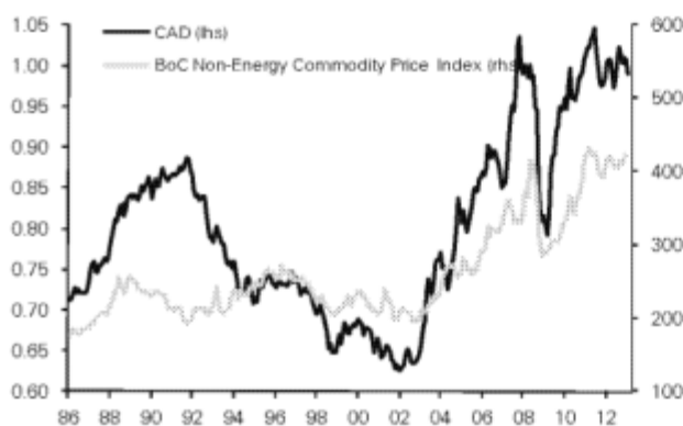
Figure 17: BoC Non-Energy Commodity Price Index (Nominal) and CAD/USD