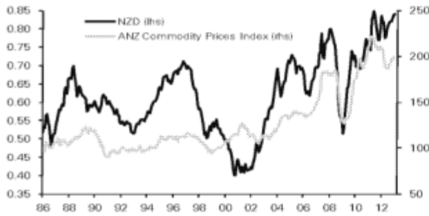
Figure 13: ANZ Commodity Price Index (Nominal) and NZD/USD