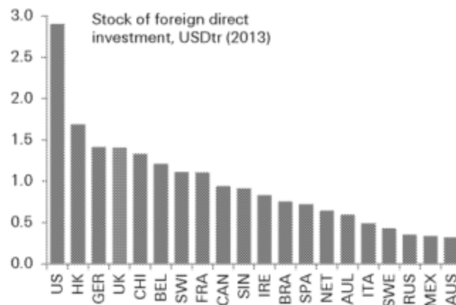
Figure 2: A swift vote should reduce risks to FDI