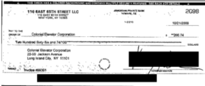
[REDACTED] NOV 02 #0000002098 $266.74