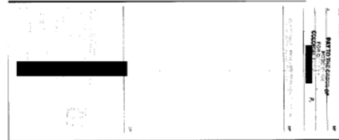
[REDACTED] NOV 02 #0000002098 $266.74