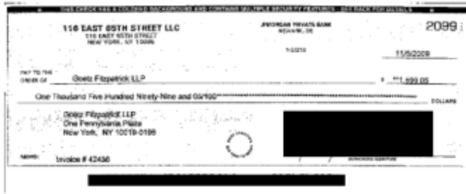
[REDACTED] NOV 10 #0000002099 $1,599.05