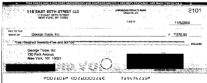
[REDACTED] NOV 12 #0000002101 $275.00