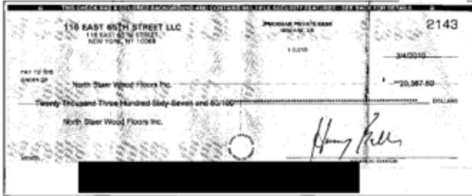
MAR 23 #0000002143 $20,367.50