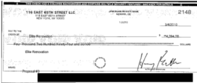
MAR 12 #0000002148 $4,294.00