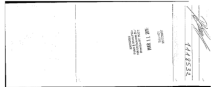
MAR 12 #0000002149 $28,905.00

You can conveniently view your statement and front and back images of cleared checks online. You can also sign up for a Paperless Statement, which allows you to stop receiving the paper version of your statement altogether. To enroll or for more information visit MorganOnline.com .