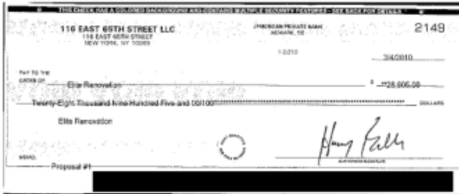
MAR 12 #0000002149 $28,905.00