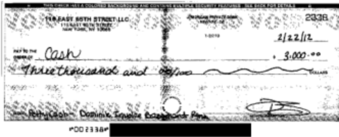
008270956634 FEB 22 #0000002338 $3,000.00