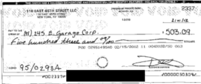
002180418955 FEB 16 #0000002337 $503.09