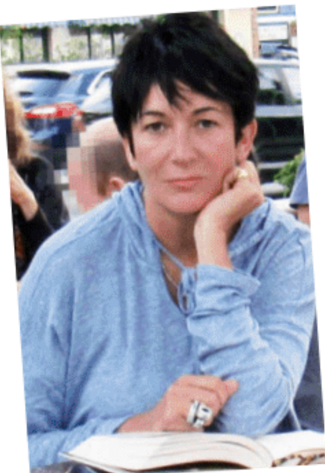
Last photo? Maxwell, outside an LA restaurant in a now-discredited shot