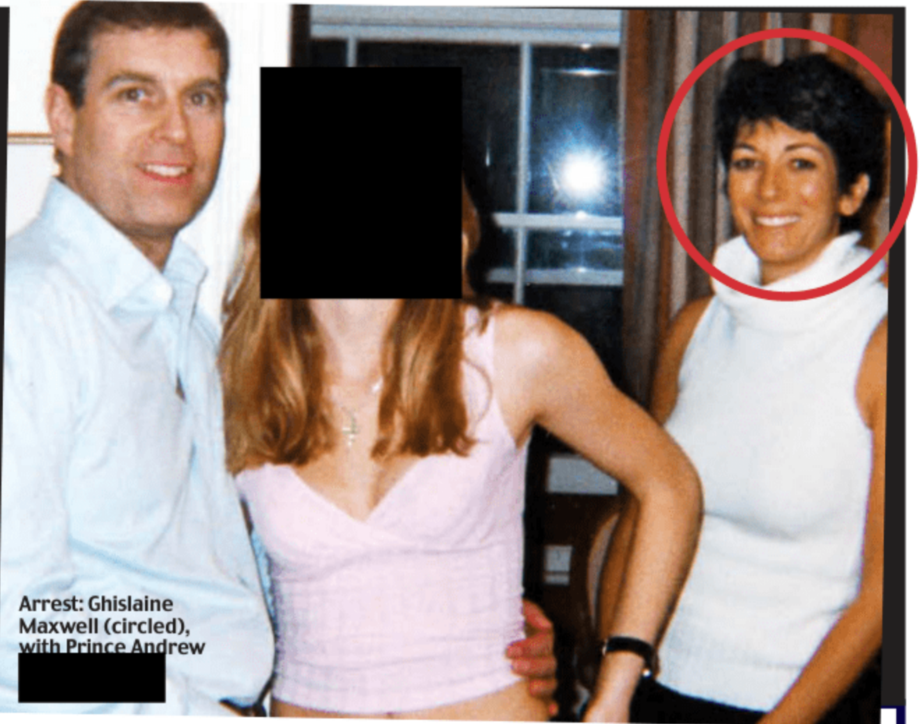
Arrest: Ghislaine Maxwell (circled), with Prince Andrew