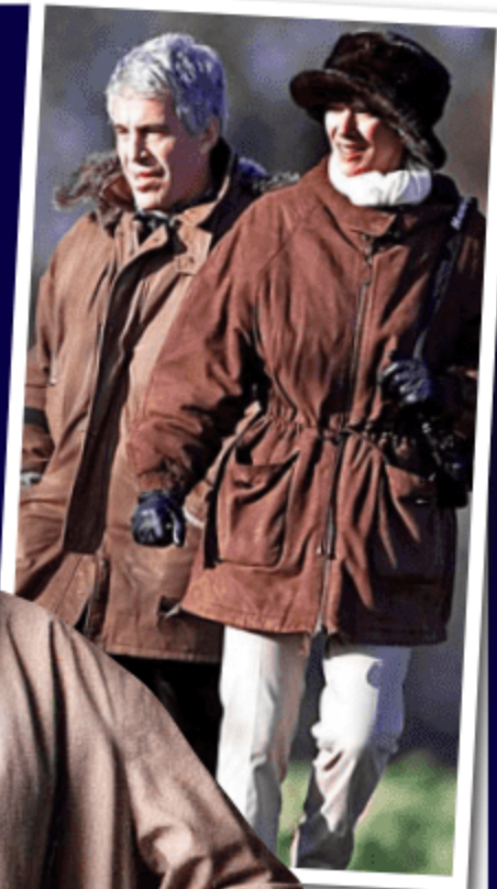
Royal guests: Epstein and Maxwell at a shoot in Norfolk, 2000