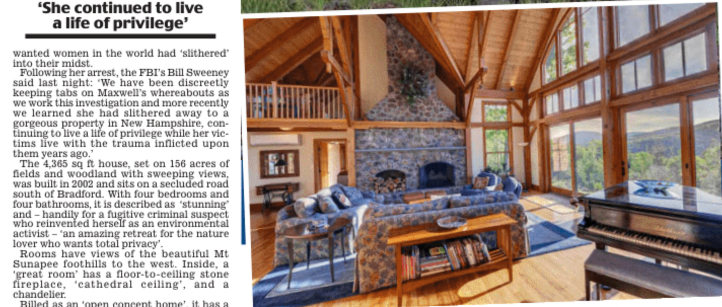
Main picture: The New Hampshire house was an ideal hideout. Above: The interior with its stunning views. Right: The property (circled) offered Maxwell the seclusion she sought

London, scene of the notorious 2001 photo of Prince Andrew placing an arm around the midriff of Epstein's then 17-year-old victim, Miss [redacted]. But neighbours have not seen Maxwell there for almost a decade.