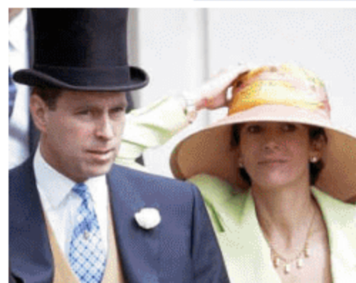
Close: Prince Andrew with Ghislaine at Ascot in 2000

are going to a restaurant then a club. Do come, it will be fun.' She was persuasive, too, and Andrew loved that.'