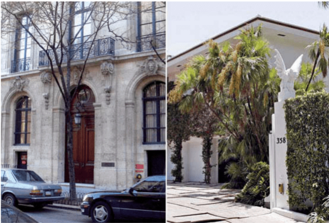
The New York Times