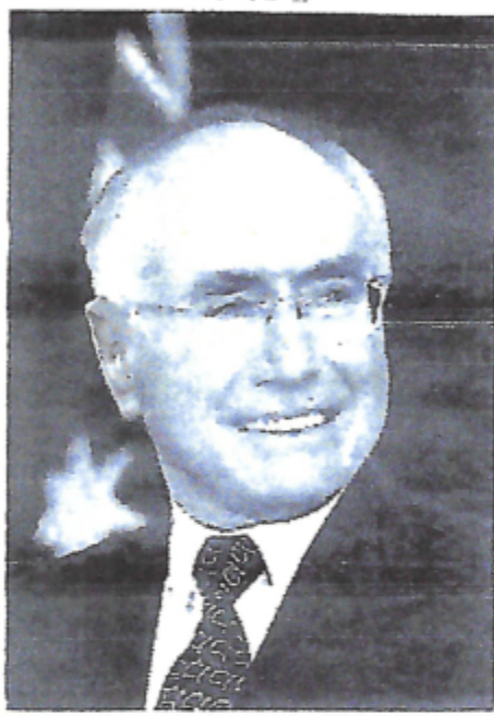
Howard in 2001

25th Prime Minister of Australia In office