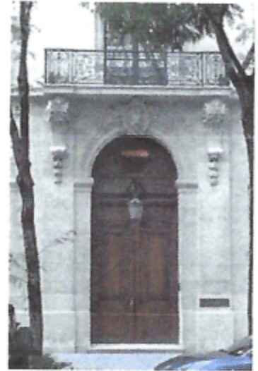
Epstein was accused of sex trafficking of minors at his mansion at 9 East 71st Street.

In 2017, ██████████ filed a suit against Epstein and Maxwell , alleging that Maxwell had hired her to give massages to Epstein and later threatened to physically harm her or destroy her career prospects if she did not comply with their sexual demands at his mansion in New York City and on his private Caribbean island, Little Saint James. The suit was settled in 2018 under undisclosed terms. [161][20][162]